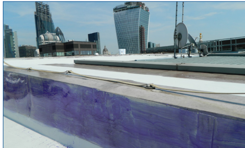
Surface conditioned to ensure good adhesion