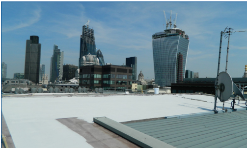
First coat of Belzona 3111 being applied