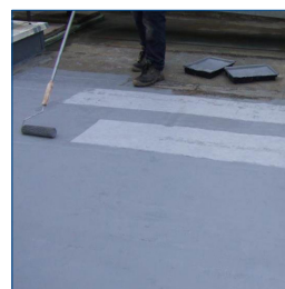
Easily applied by brush or roller