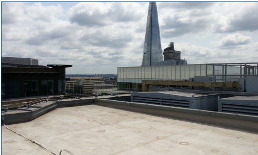
Roof cleaned and prepared

The client expressed themselves thoroughly satisfied with the application. The Project Co-ordinator said, "The contractors who carried out the works did a great job in a professional manner and we experienced no interruptions to business or complaints throughout the entire project." He further added, "I will definitely be recommending Belzona in any future projects where their system can be utilised." ■