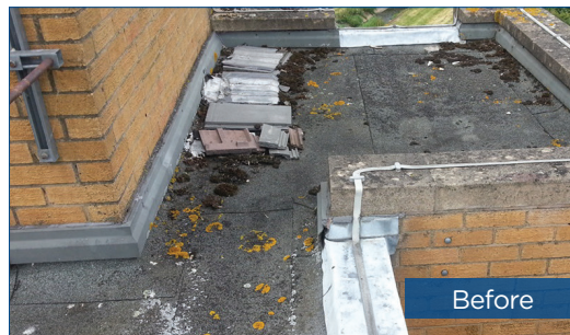
Long-term roof protection