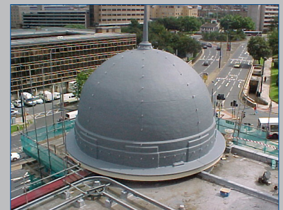
Follows complex contours

With its ability to provide impermeability to liquids, but permeability to water vapor - allowing the roof to breathe - this product offers a solution to roof leaks.