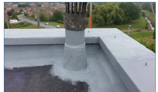
Application onto complex contours