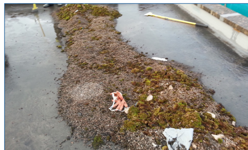
Removal of debris and vegetation

Due to the versatility of the Belzona roofing system, the application team were able to facilitate a series of bespoke repairs specially designed for each different application situation. The tough, flexible and elastic polymeric film tightly follows all roof contours, encapsulating and providing long-lasting protection to every area of the roof. ■