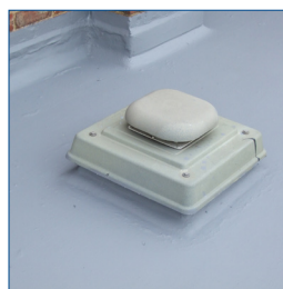
Remains flexible in service