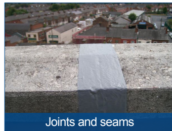
Joints and seams

Scan the QR code to watch the Belzona 3121 YouTube video