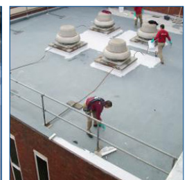
Belzona 3111 application in progress